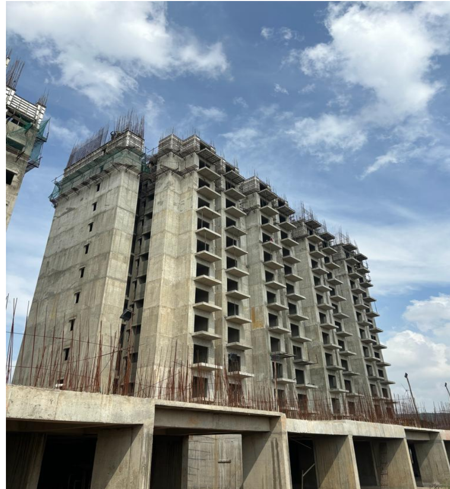
11 th FLOOR P2 REINFORCEMENT WORK IN PROGRESS