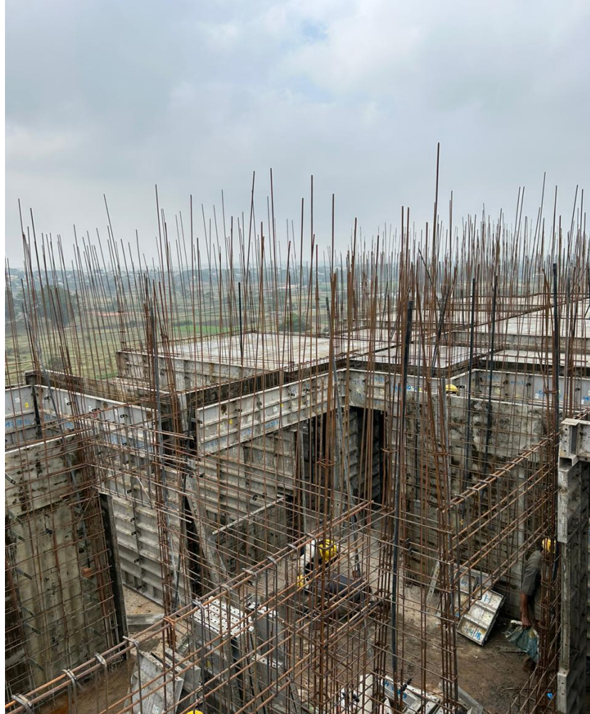
11 th floor Pour - II