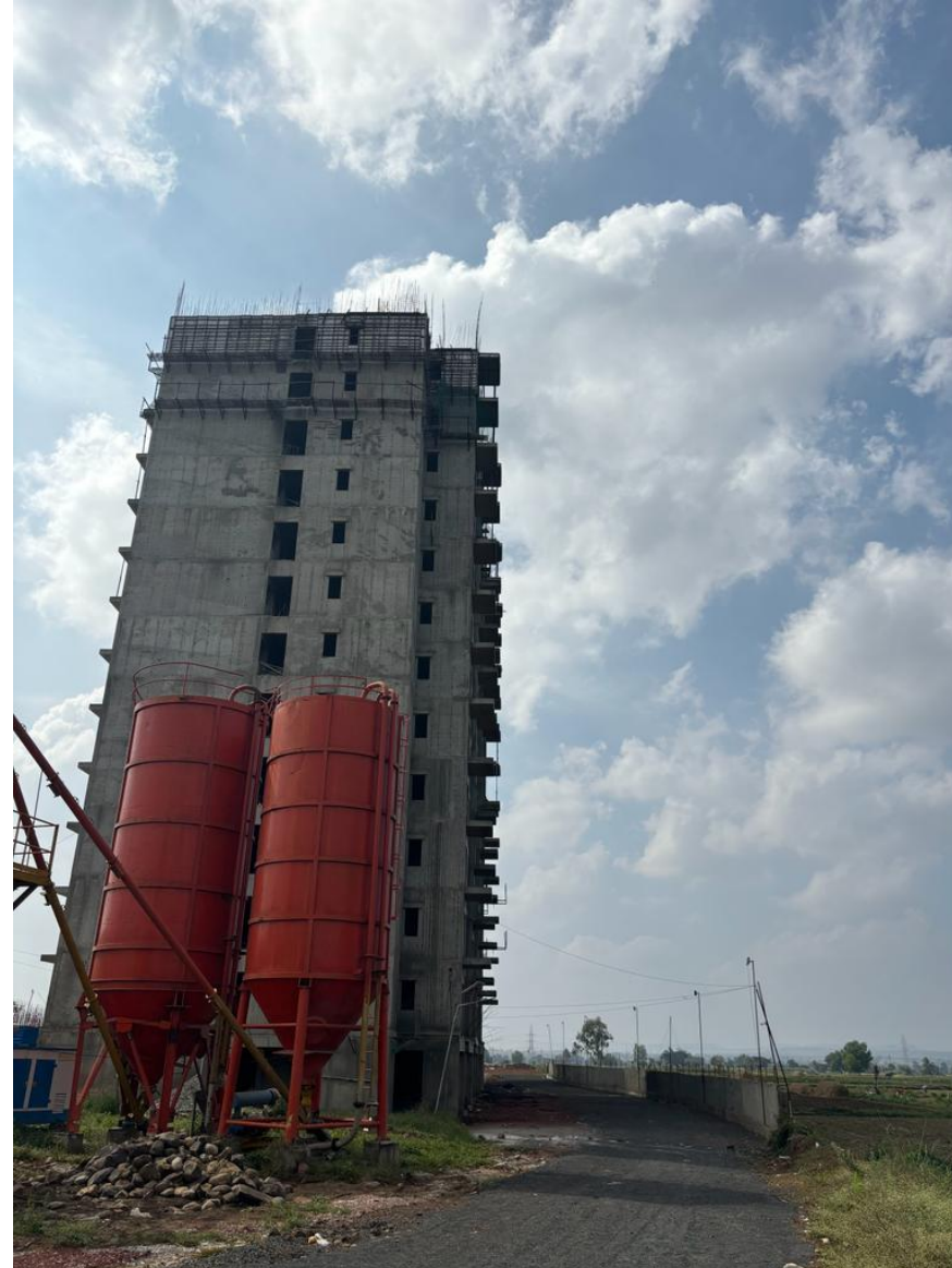
EAST SIDE VIEW