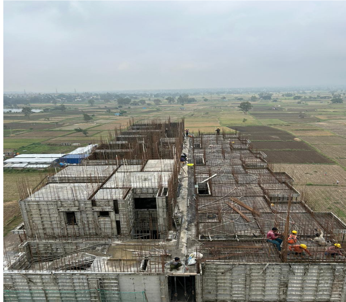
8 TH Floor P2 Ready for Casting & 9 TH Floor P1 Shuttering Work in Progress