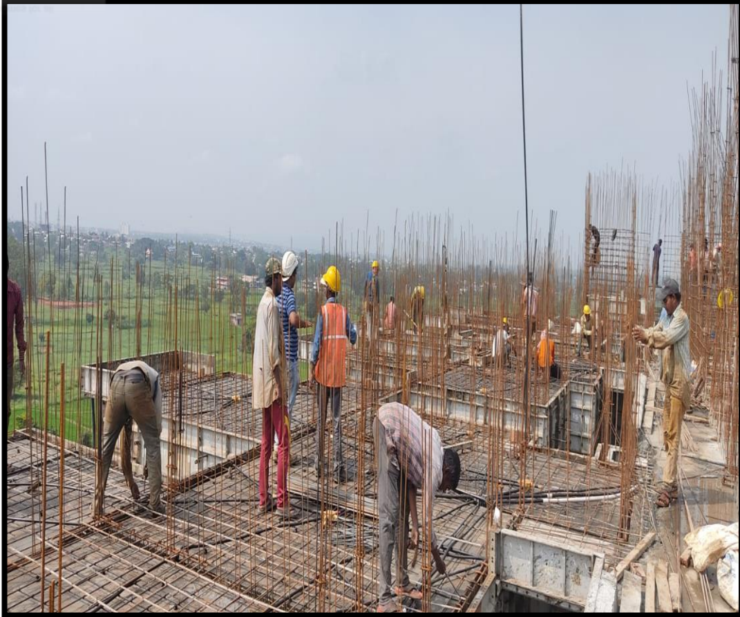
8 th floor Pour - II