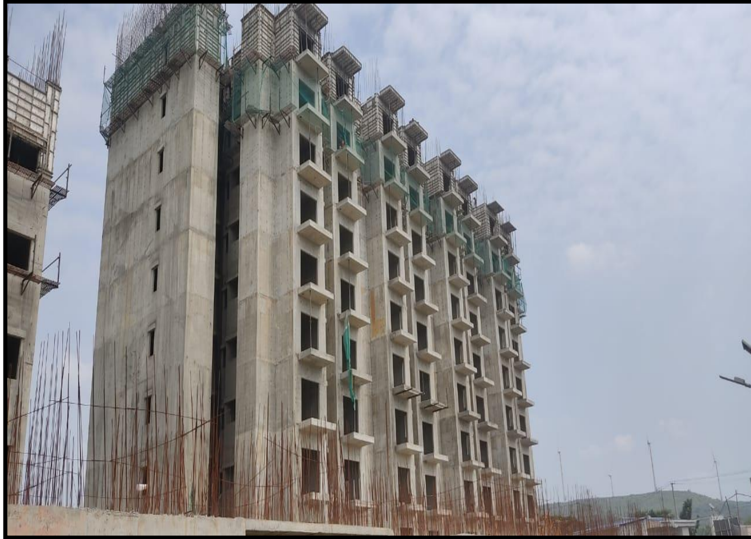
9 th FLOOR WALL REINFORCEMENT WORK IN PROGRESS