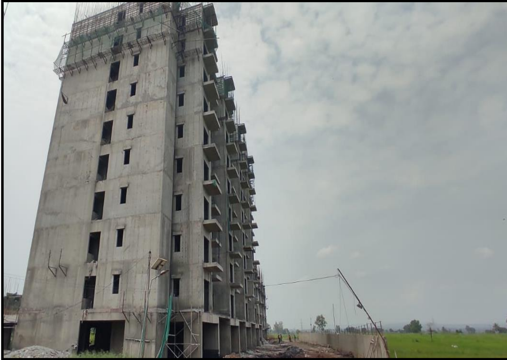
EAST SIDE VIEW