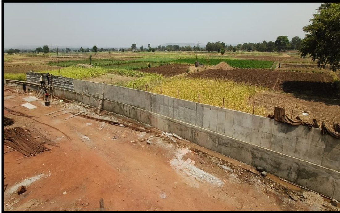
North Side Compound wall Reinforcement work is in progress