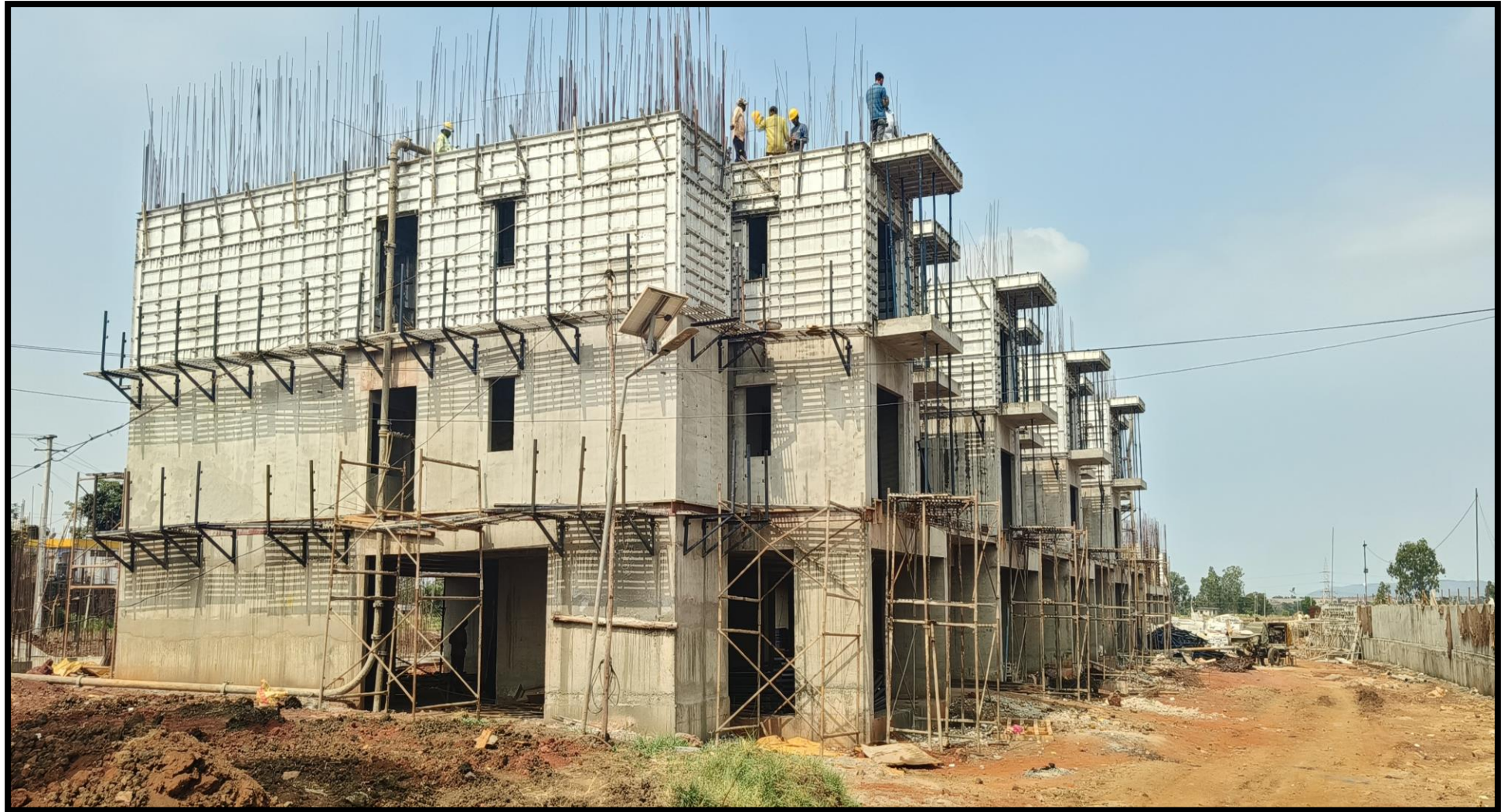
1 ST FLOOR ALUFORM WORK IN PROGRESS