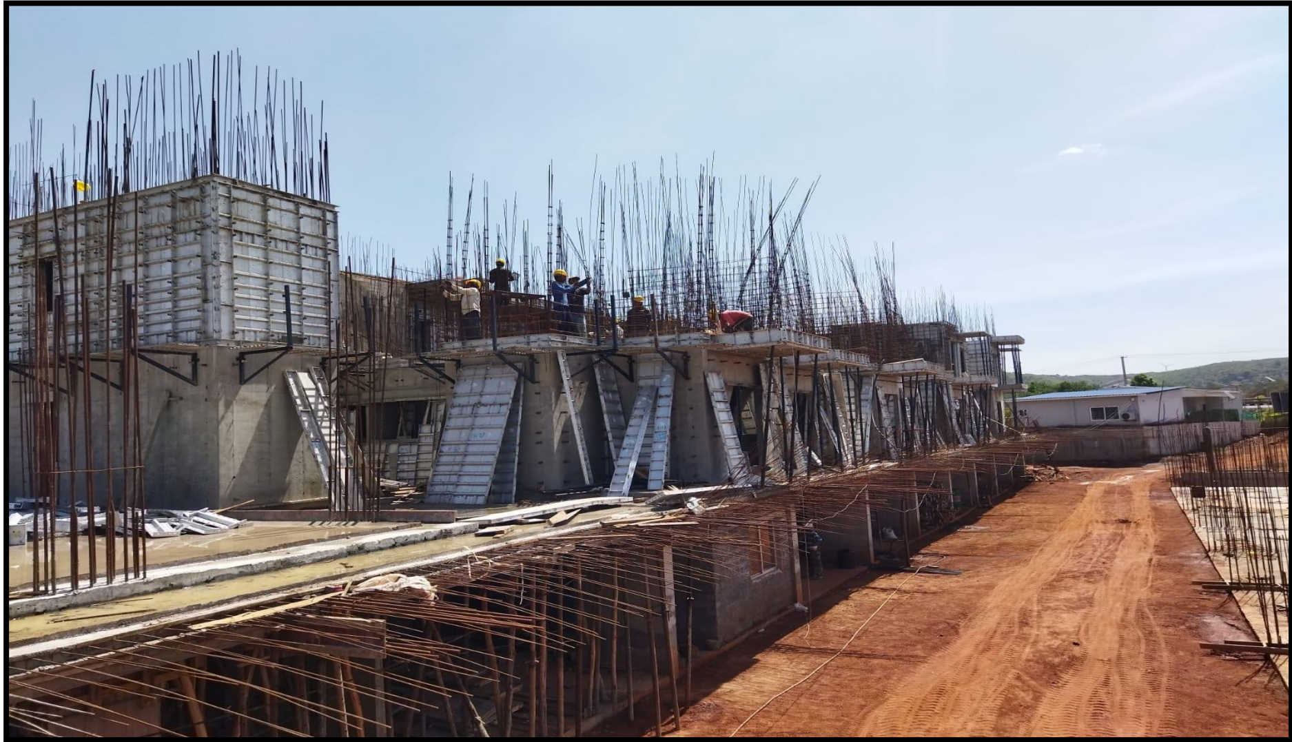
1 ST FLOOR SLAB REINFORCEMENT & ELECTRICAL CONDUITING WORK IN PROGRESS